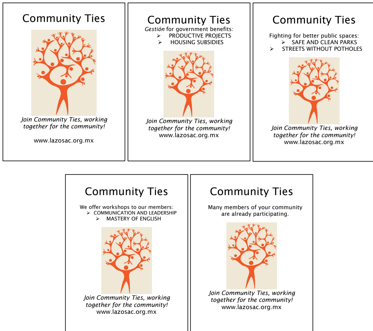
Figure 2: Control and Treatment Conditions

The services condition (lower-left) stated: “We offer workshops to our members: Communication and Leadership, Mastery of English.” These incentives qualify as excludable, given